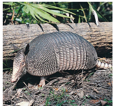
Figure 1 Well hung — the nine-banded armadillo, Dasypus novemcinctus .

From Kelly's unpublished survey of other mammalian species, it is likely that all mammalian penises are wrapped the same way as the armadillo's, in orthogonal-fibre arrays. So why has it taken us so long to realize this? One can only surmise that most scientists (or the male ones at least) have been